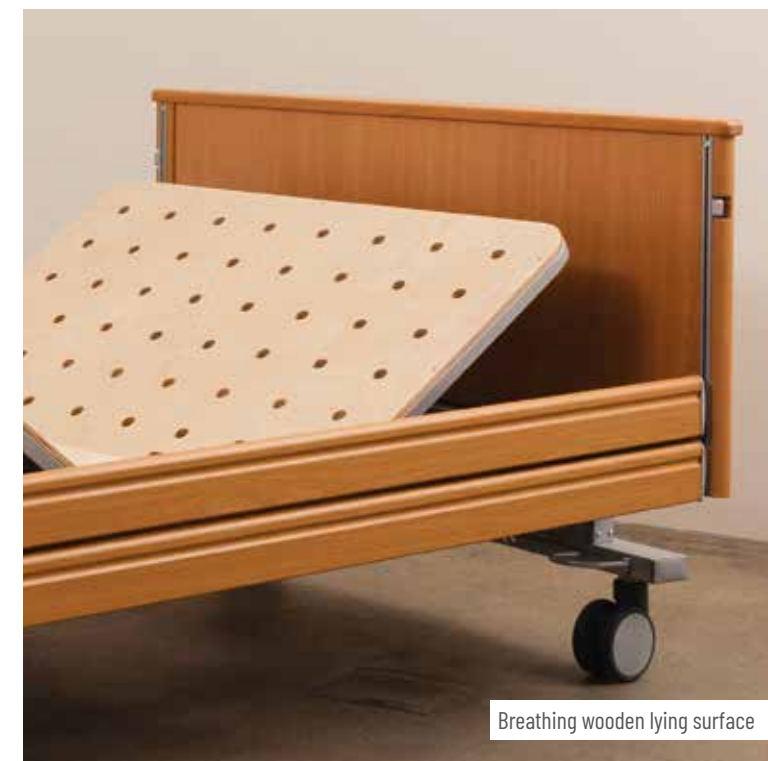
Breathing wooden lying surface