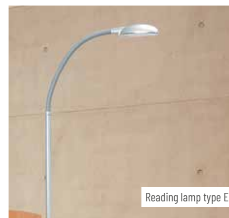
Reading lamp type E