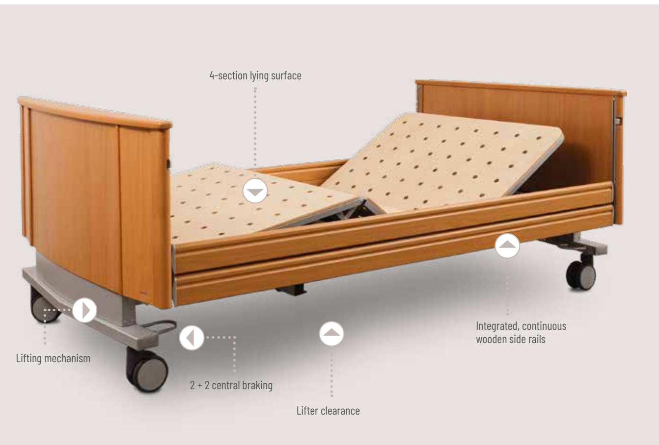
4-section lying surface