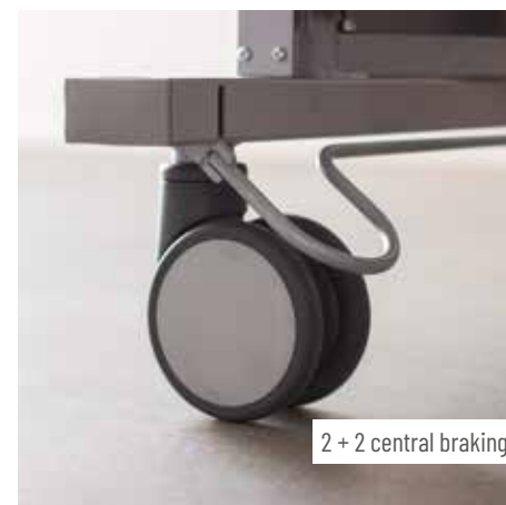
2 + 2 central braking