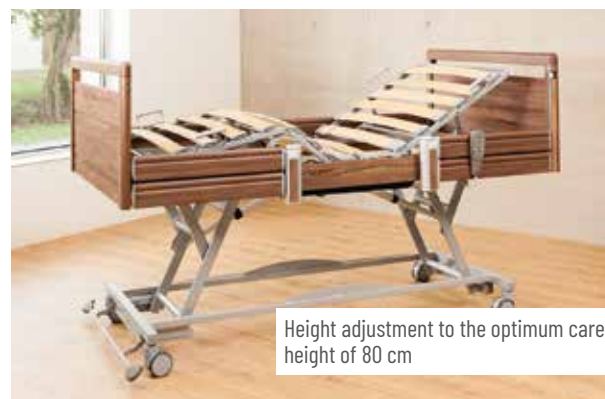
Height adjustment to the optimum care height of 80 cm

Product specifications, end panels and accessories can be found from page 56 onwards