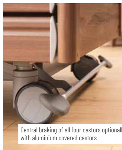
Central braking of all four castors optionally with aluminium covered castors