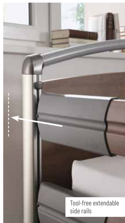
Tool-free extendable side rails