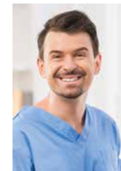
Holger (32), Cologne

“The integrated, tool-free bed and side rail extension is a striking feature - here, someone really had some great ideas. And our residents also love ‘their’ practico alu plus”!