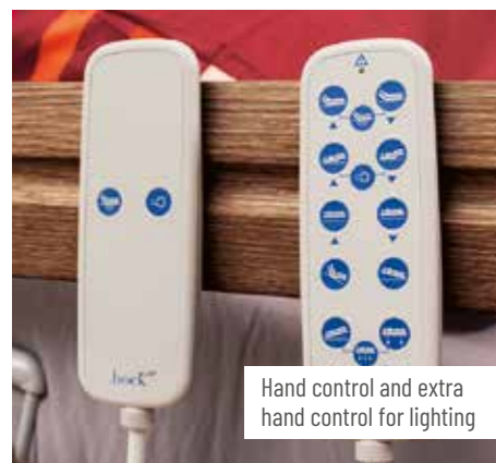
Hand control and extra hand control for lighting