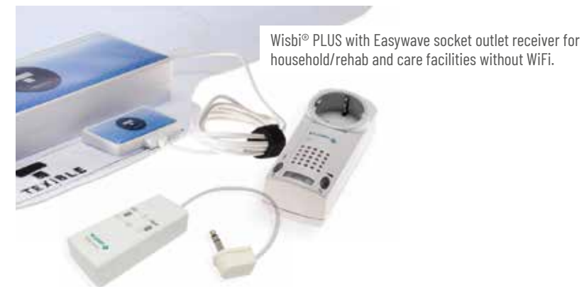
Wisbi® PLUS with Easywave socket outlet receiver for household/rehab and care facilities without WiFi.