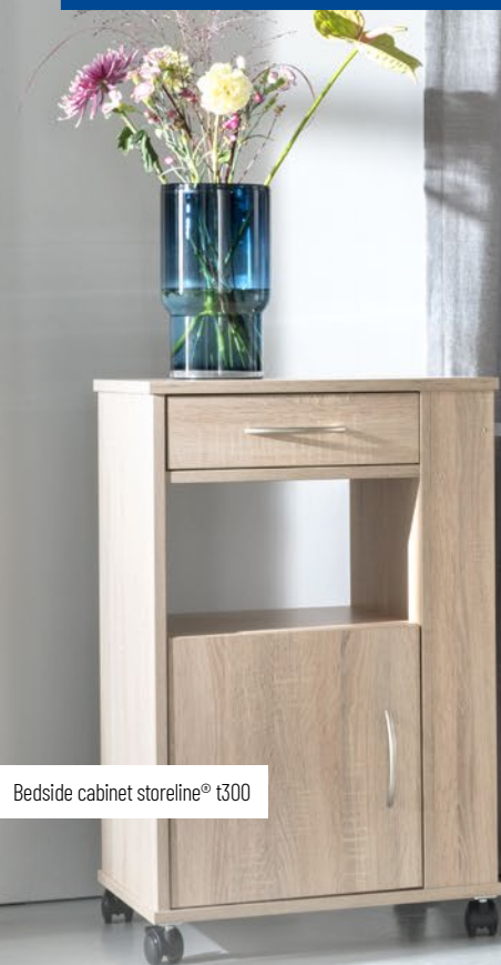
Bedsideside cabinet storeline® t300

Makes comfortable care even simpler: the bock storeline®