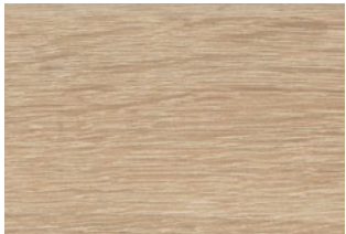
Sonoma Oak R20128