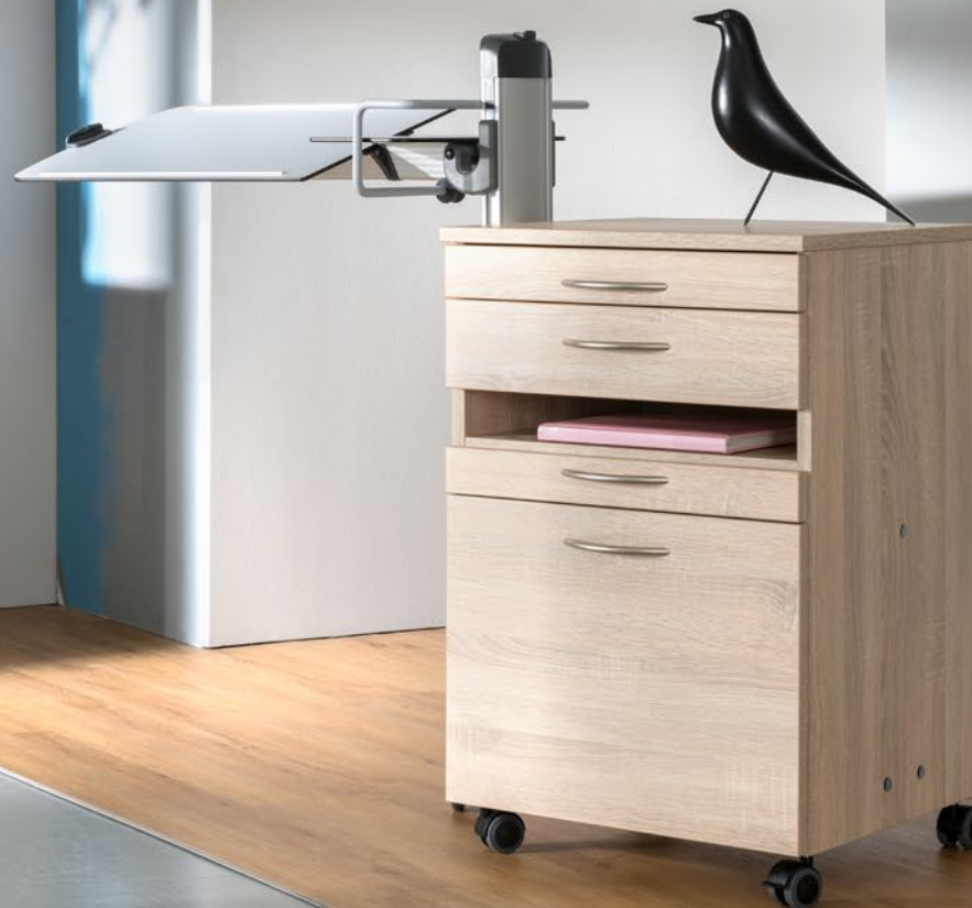
Bedsideside cabinet storeline® t103 with flexible server s100