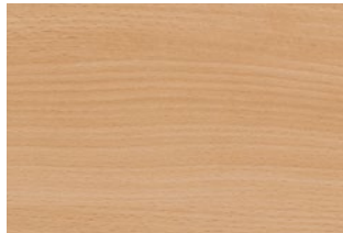
Bloomed Beech R24035