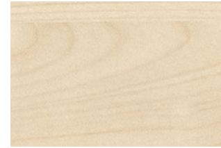
Royal Maple R27001