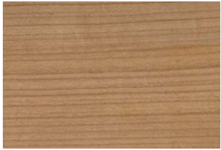
Cherry Havanna R42006