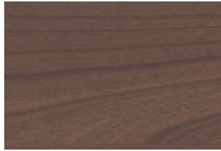
Madison Walnut R30011