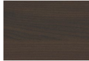
Maple After Eight R27017